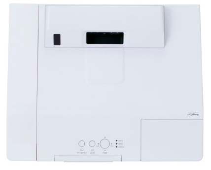
Top View (with cable cover)